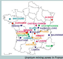
Uranium mining zones in France